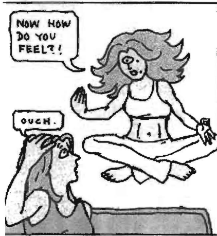
Fig. 4. Cancer Vixen (2006:159).

In a representative, periodic visitation, the universal panoptic emblem appears in Cancer Vixen as an over-sized third eye, stamped into the forehead of cartoon-narrator Marisa's metaphysical doppelgänger (Fig. 4).