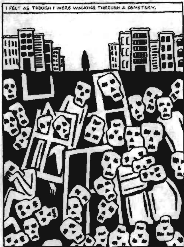
Fig. 3. Persepolis: The Story of a Return (2004:97).

suffered through the narrator's dislocation as well as how they are psychologically experienced. Likewise reinforcing the theme of exile, gothic correspondences are visible in a photo-like portrait of Marjane surrounded by freakish, adolescent friends, including the macabre Momo, who is obsessed with death (Satrapi, 2004:13). Cartoon Marjane's geographical estrangement is further dramatized near the centerfold of book two with reintroduction of Islamic patterning, reproduced in a three-quarter-page panel that accents a close-up of her face as, preparing to leave Vienna, she "again puts on [her] veil" and confronts her eastern-doppelgänger reflection in a mirror (2003:91).