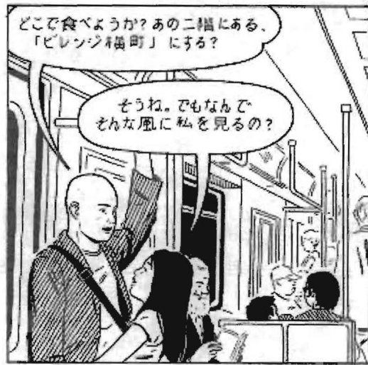
Fig. 6. Shortcomings (2007:90).

Verbal code switching in comics that similarly blurs and slips along imagistic-linguistic divides invites decoders to translate meanings that elude or bypass the symbolic order, a stylistic gesture that mirrors changing pattern-language demographics in the virtual world. (Recall for instance Gibson's allusions in Pattern Recognition to Kanji or Cyrillic as viewed by an English-only reader.) As the pattern of comics uniquely inscribes, the future of seeing-as-reading has arrived.