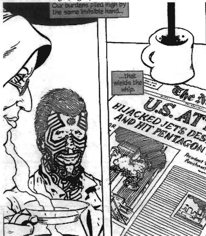
Fig. 5. Can't Get No (2006:n.p.).

In a telling pictorial sequence, Chad, now a solitary, challenging figure again similar to a pachuco separated in time and space from the society from which he originates (Paz, 1961 [1950]:17), momentarily finds safe harbor along the roadside with a Lebanese-immigrant couple, who have fled the city in an RV. Functioning through dialogic integration and code sharing, Chad's graphic tag and the wife's headscarf personify the trauma of east meeting west in our contemporary, ongoing phase of geopolitics, where boundaries collapse and atomize on the world stage (Fig. 5).