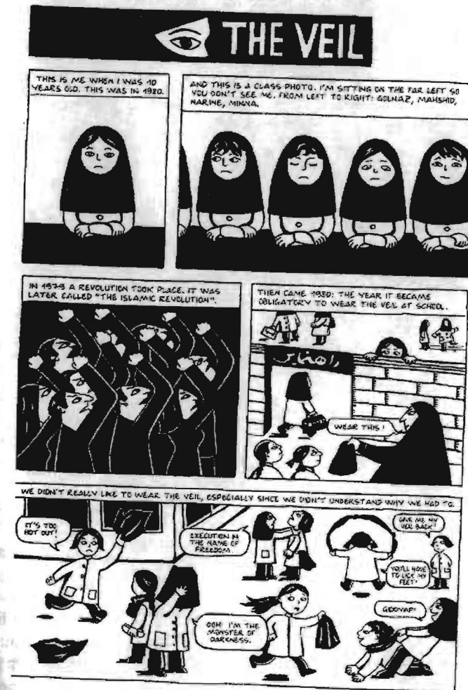
Fig. 1. Persepolis: The Story of a Childhood (2003:3).

Named for a ruined, ancient Persian capital city (circa the first millennium BCE) and framed in time by modern-day events pertinent to Iranian history, the Persepolis books chronicle aristocrat-descended Satrapi’s life between the ages of six and twenty-five, relaying her child-eyed experience of Iran’s revolution of 1979, her high-school years spent sans family in Austria, and formative period as a university graphic-arts student and young wife in Tehran following return to her homeland in the late 1980s. Geopolitical space, documentary perspective, and ontological outlook are simultaneously branded in Persepolis through a braided lexicon of symbols and signs, drawn and written completely in stark, black-and-white and announced on the opening