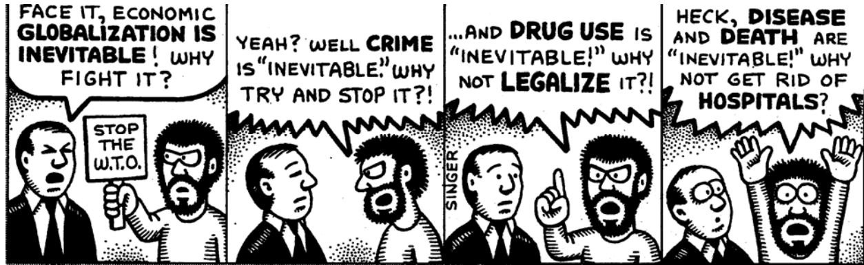
Cartoon: Mack Truck of Life Part 2